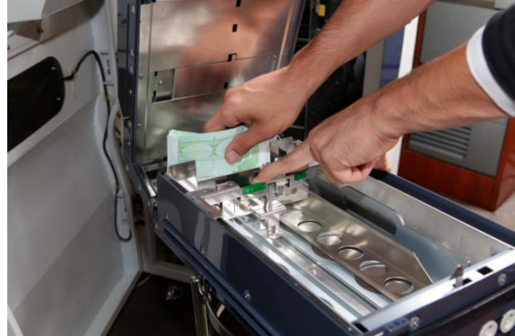
Each cassette holds up to 3.000 banknotes (in ATM-fit condition)