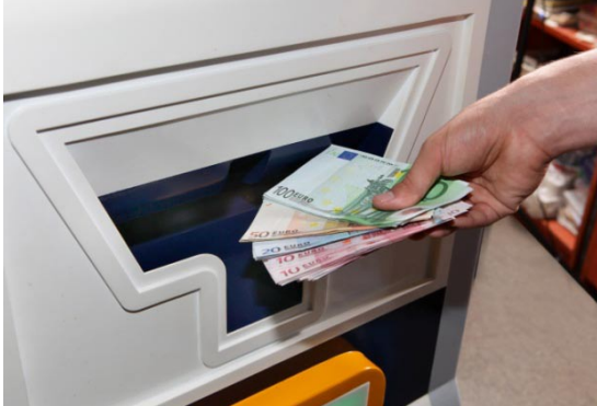
Adaptable to any currency and language.